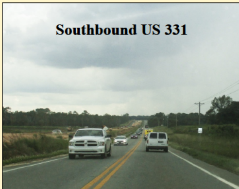
Southbound US 331

FDOT is closer to completing the US 331S four-lane project. A single northbound lane is getting some blacktop. This will help with congestion on the busiest road in the city. Yay!