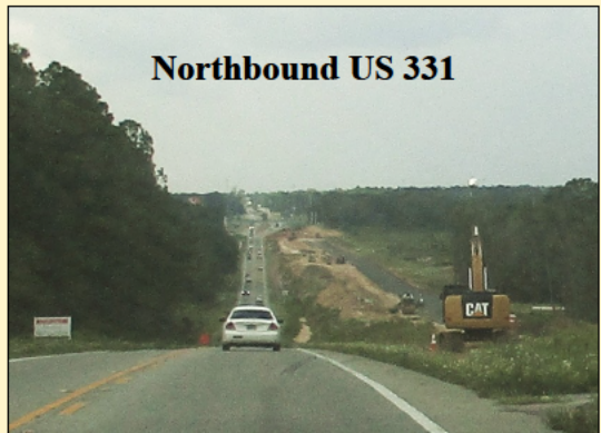
Northbound US 331

FDOT is closer to completing the US 331S four-lane project. A single northbound lane is getting some blacktop. This will help with congestion on the busiest road in the city. Yay!